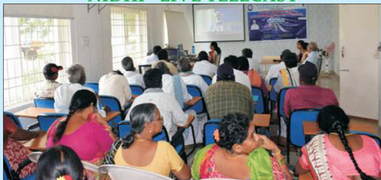
Awareness on Kisan Samman Nidhi

A total of 97 farmers and farm women witnessed the live telecast of the launch of PM Kisan Samriddhi Kendras and release of 14 th installment of Kisan Samman Nidhi on 27.07.2023 at KVK, Guntur. The participants were informed regarding the activities of KVK and the role of RBKs and KSKs for farmers. All the participants visited the KVK including livestock demo units and were informed about the schemes being implemented for income generation of the lower group.