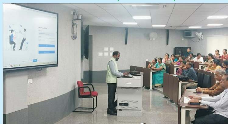
Faculty Attending the Awareness Program on Drill bit