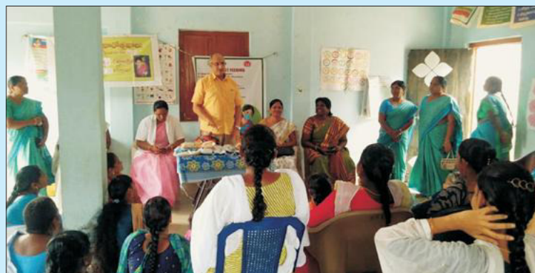
Awareness on Breast Feeding among Lactating Mothers and Pregnant Women