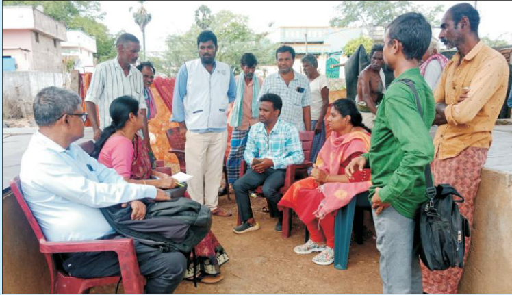
Interaction with Vets, Para Vets and Farmers