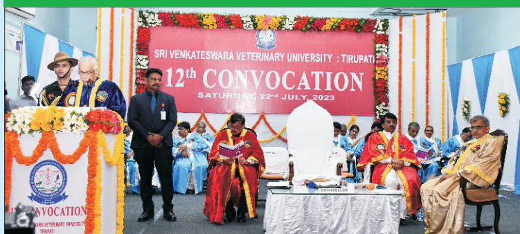
Message of Hon'ble Governor