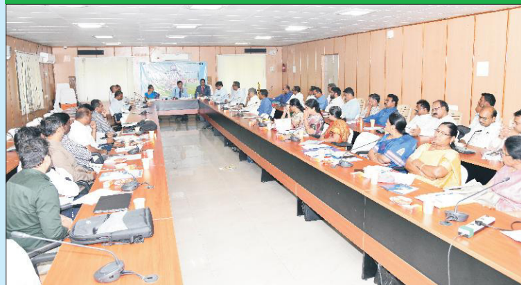
Review of Research Projects at 16 th SLTP Meeting

The XVI State Level Technical Programme Meeting was held from 12 th to 13 th September 2023 under the Chairmanship of the Director of Research to review the progress of work done during 2022-23 and to finalize the technical program and research mandate of the Research Stations and Research Projects for the year 2023-24 in the presence of all Heads of Research Stations, Principal Investigators of externally funded research projects, University Heads of all the Departments and University Officers for reviewing the progress of work.