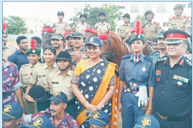
Display of equestrian skills of 2(A) R&V NCC Unit

National Sports Day was celebrated gracefully on 29 th , August 2023 at CVSc, Proddatur. Sports (1000m and 2000m Marathon, Shot put) and Games (Volleyball and Shuttle Badminton) competitions were conducted for boys and girls on this occasion. The Associate Dean of the college presided over the meeting wherein the importance of Sports in daily activities, and their role in building a fit society was emphasized. All the students and staff who participated in the programme had taken the "Fit India Pledge"