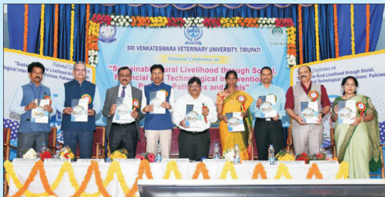
Release of Compendium at National Conference