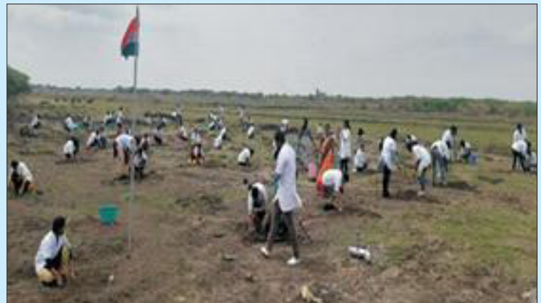
Saplings Plantation at CVSc, Proddatur