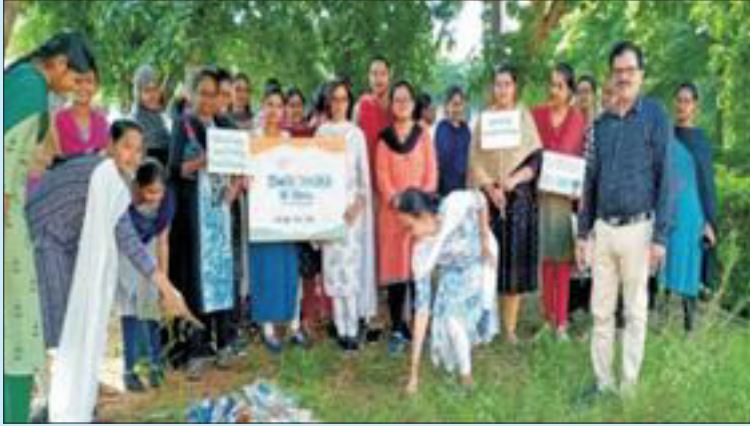
Swachhta Hi Seva at NTR CVSc, Gannavaram

As a part of Swachhta Hi Seva (SHS)(15.09.2023 to 02.10.2023), Cleaning activity, Awareness on single use of plastic, Swachhta pledge taking activities have been organized on 29.09.2023 at NTR CVSc, Gannavaram with active participation of all the NSS volunteers. The NSS program Officers enlightened and motivated the students with the theme of the program.