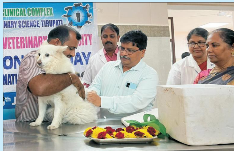
World Zoonoses Day Celebrations at CVSc, Tirupati