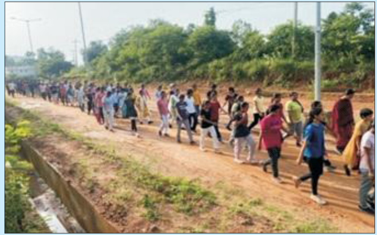
Celebration of National Sports Day at CVSc, Garividi