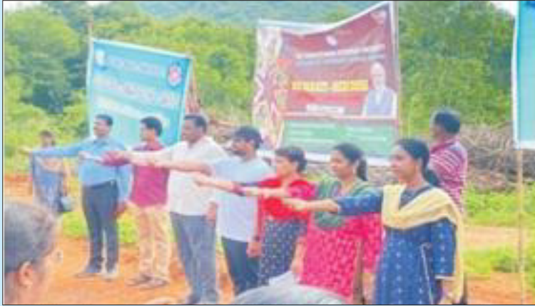
Panch Pran Pledge at CVSc, Garividi

Hostel premises was done in coordination with the District Forest Officer, Kadapa. Orientation of students to Yuva portal and successful registration of the same by the NSS volunteers was taken up under the supervision of NSS programme officers. The students took the Panch Pran pledge during this programme.