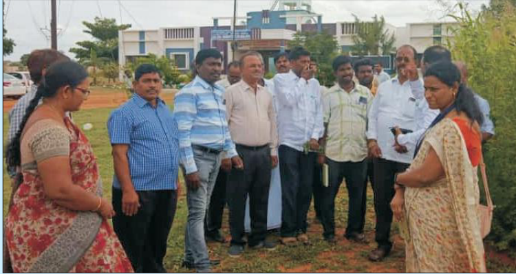
Farmers Training Programme at SGRS, Banavasi