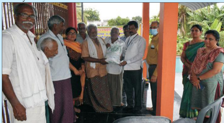
Distribution of Biofertilizers to Pulses Farmers

The DE, SVVU along with all Scientists and Head of KVK, Guntur visited Vallabhapuram, DFI village of KVK, and Kothapalem village on 22nd September 2023 and interacted with the farmers, beneficiaries under different OFTs, FLDs, and CFLD Pulses. The Director of Extension, SVVU distributed inputs to the selected farmers for conducting OFTs and FLDs of Veterinary Science at Vallabhapuram village of Kollipara mandal. The selected farmers were distributed with Biosaal (yeast and soda bicarb mixture) for improving milk fat as a part of OFT. As a part of FLD veterinary science, Chromyeast a probiotics feed supplement for improving digestion, milk yield was distributed to selected six farmers.