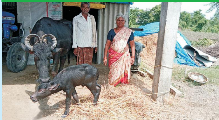
Female Buffalo Calf Born through IVF Using Sexed Embryo