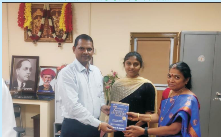
Awarding the Winners of essay writing competition at CVSc, Tirupati