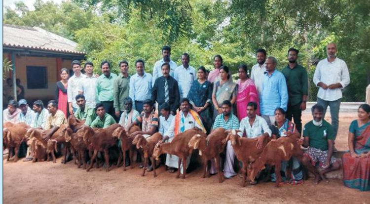
Distribution of Rams to Farmers