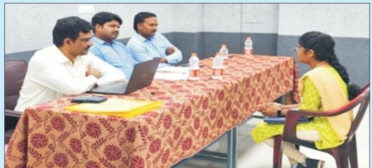
Campus Placement Interviews at CDT, Tirupati

Sangam Milk Producer Company LTD and Dodla Dairy LTD have conducted the campus placement interviews for the final year B. Tech DT students at Department of Dairy Microbiology, CDT, SVVU, Tirupati.