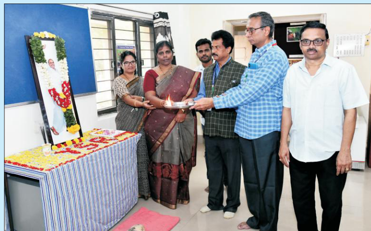
Rythu Dinosthavam Celebrations at CCVEC, Tirupati