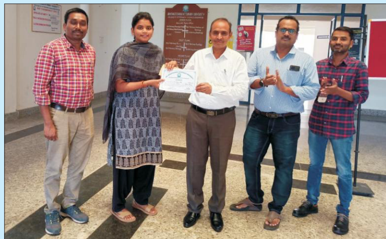
Awarding the Winners of essay writing competition at CVSc, Proddatur