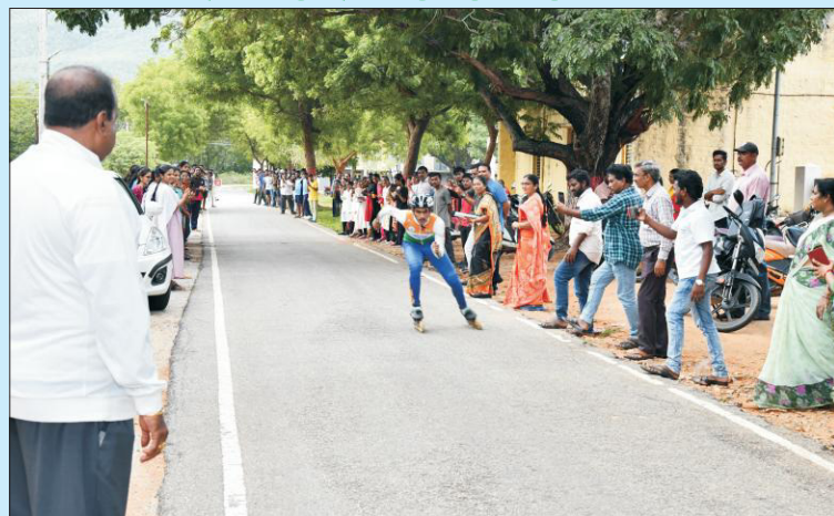
National Sports Day Celebrations at CVSc, Tirupati

On 29 th August 2023, National Sports Day was celebrated in connection with Hockey Legend Major Dhyan Chand's birthday at Sports Pavilion, C.V.Sc., Tirupati. The Associate Dean, Physical Director, all the NSS Programme Officers, teaching, non-teaching, and students participated in the event.