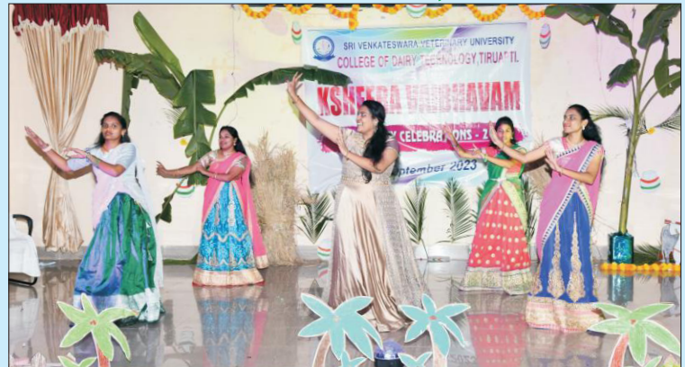
Ksheera Vaibhavam at CDT, Tirupati

All the teaching and non-teaching staff of the College participated in the "KsheeraVaibhavam College Day celebrations" on 8 th September 2023 at CDT, SVVU, and Tirupati.