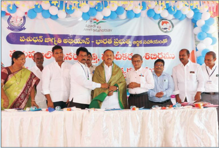
Fertility Camp and Workshop Organized as Part of Pashudhan Jagruti Abhiyan