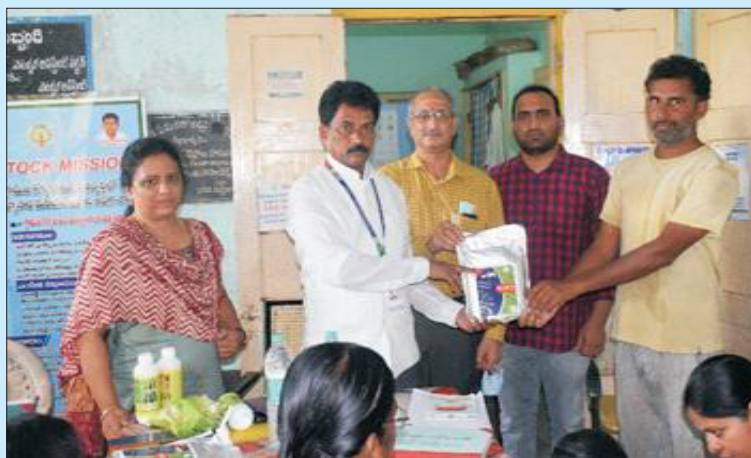
Distribution of Probiotics to Livestock Farmers

The DE, SVVU along with all Scientists and Head of KVK, Guntur visited Vallabhapuram, DFI village of KVK, and Kothapalem village on 22nd September 2023 and interacted with the farmers, beneficiaries under different OFTs, FLDs, and CFLD Pulses. The Director of Extension, SVVU distributed inputs to the selected farmers for conducting OFTs and FLDs of Veterinary Science at Vallabhapuram village of Kollipara mandal. The selected farmers were distributed with Biosaal (yeast and soda bicarb mixture) for improving milk fat as a part of OFT. As a part of FLD veterinary science, Chromyeast a probiotics feed supplement for improving digestion, milk yield was distributed to selected six farmers.