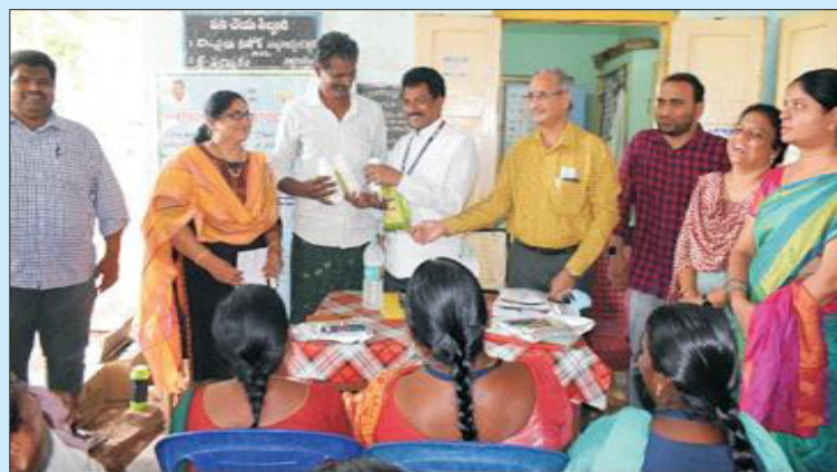
Distribution of Vegetable Seed Kits to Farmers

Mangalagiri mandal as a part of CFLD pulses, black gram seed (LBG 884) was distributed to 25 farmers.