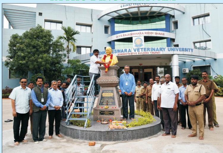
Rythu Dinosthavam Celebrations at Dr YSR Bhavan, SVVU