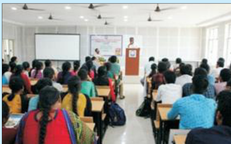
Celebration of Anti-Ragging week at CVSc, Garividi