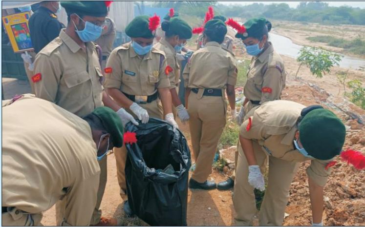
NCC Cadets Involved in Plastic Clearance near Kalyani Dam