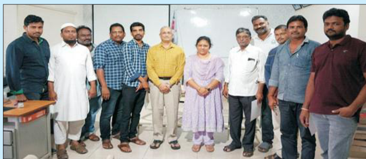
Farmers with the Scientists of KVK