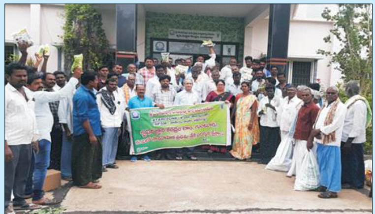
Distribution of Redgram Seed and Biofertilizers Under CFLD Pulses