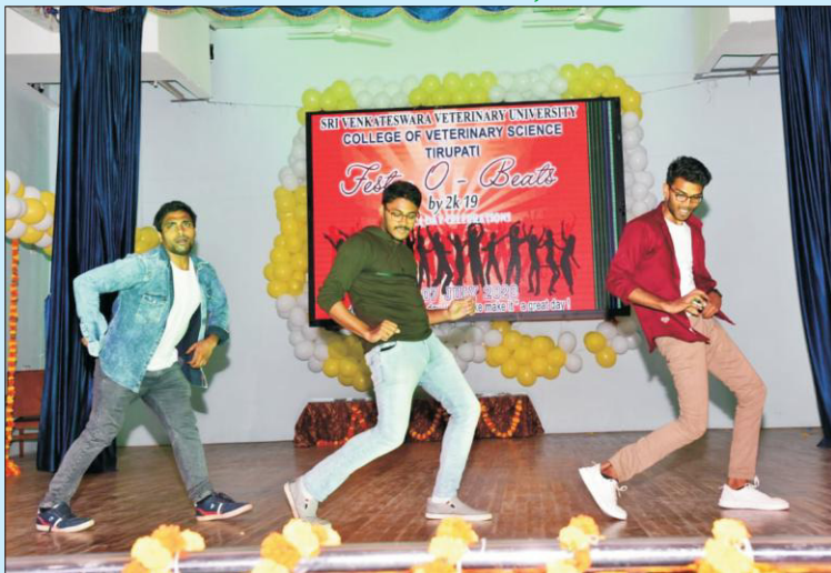
Fest -O- Beats at CVSc, Tirupati