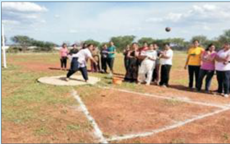
Sports Organized on National Sports Day at CVSc, Proddatur

National Sports Day was celebrated gracefully on 29 th , August 2023 at CVSc, Proddatur. Sports (1000m and 2000m Marathon, Shot put) and Games (Volleyball and Shuttle Badminton) competitions were conducted for boys and girls on this occasion. The Associate Dean of the college presided over the meeting wherein the importance of Sports in daily activities, and their role in building a fit society was emphasized. All the students and staff who participated in the programme had taken the "Fit India Pledge"