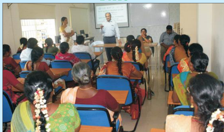
Celebration of Technology Days at KVK, Guntur

The Krishi Vigyan Kendra, Lam, Guntur celebrated technology days from 16.07.2023 to 18.07.2023 on the eve of ICAR Foundation Day. On this occasion, the technologies of ICAR were exhibited on the premises of KVK on all three days, and conducted discussions with farmers on all three days covering topics of all the disciplines viz. Veterinary and Animal Husbandry, Crop Production, Crop Protection and Home Sciencesuch as benefits of clean milk production, heat detection in cattle and buffaloes, planning for a year a calf program,