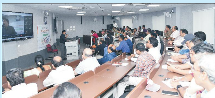
University Officers Enlightening the Faculty on Blended Learning Programme