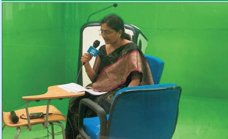
Recording of Radio Talks at Digital Studio

Eight (8) Radio talks were recorded at Digital Studio, CCVEC, SVVU, Tirupati on 29 th September 2023 by the teaching faculty of CCVEC and College of Veterinary Science, Tirupati on various topics Backyard poultry rearing in rainy season, economical rearing of ram lambs, Quails rearing, Metabolic diseases in dairy animals, the importance of mineral mixtures and probiotics, value addition of milk products and Anthrax in animals and its control measures in vernacular language and broadcast through AIR Kisanvani Program for the benefit of Rural Farmers.