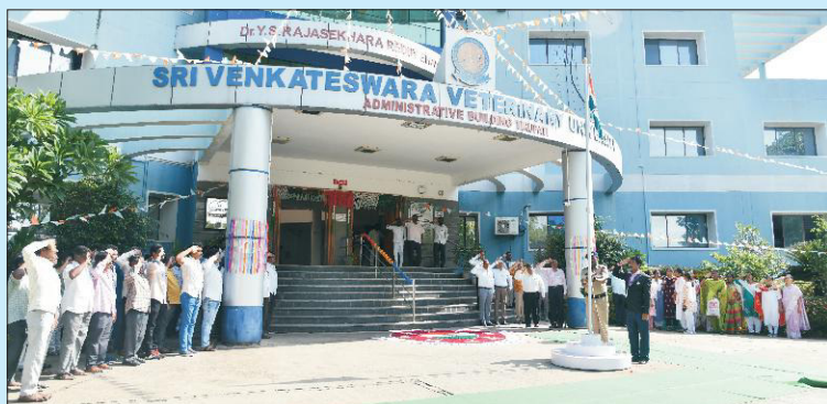
Independence Day Celebrations at Dr. YSR Bhavan, SVVU